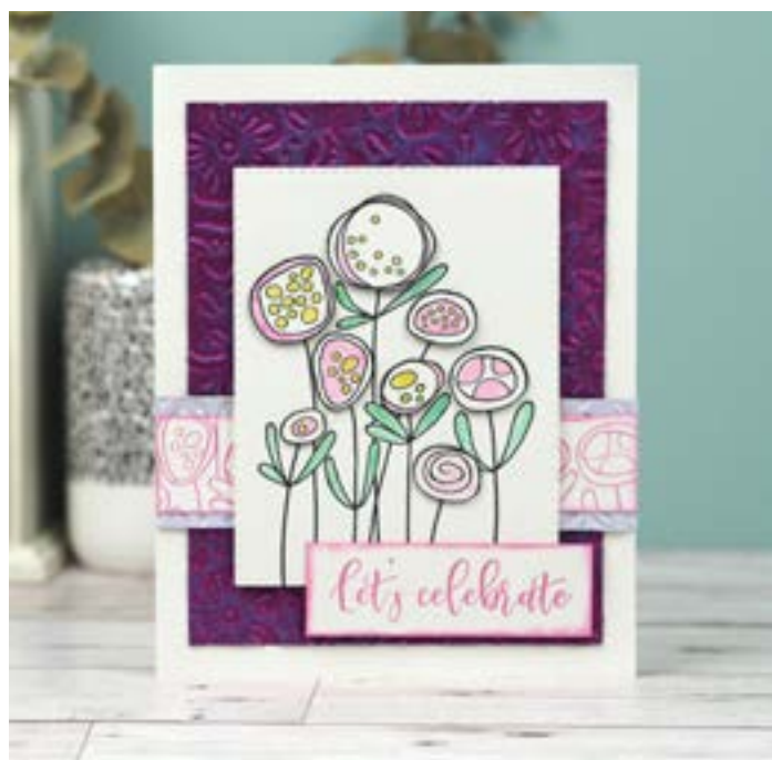
CED9306 Shadow Boxes Collection Scalloped Lattice Frames – Set B (optional)

Spray bottle, Die cutting machine, Foam tape