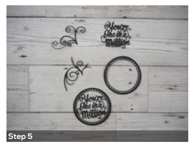
From Raven Black card, cut 3 curly flourishes from the 'Layered Loop' die set and four frames using the 'You're One In a Million' die. Trim out the wording from three.

Cut inked Coconut white card to 14cm x 19.5cm. Position the mask over random areas of the inked card and wipe over lightly with a baby wipe (make sure its not too wet to prevent seeping under the mask) then use a paper towel to dry. Lift the mask to reveal the pattern. Glue to the card blank.