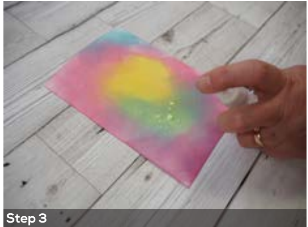
Spritz the water to blend the colours.