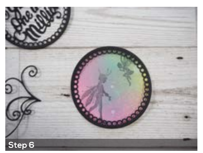
Using the base die from the 'You're One In a Million' die set cut out 4 circles from the inked coconut white card. Stamp the fairies and elves onto three of the circles.

Glue the 'You're One In a Million' frame onto one of the coloured circles. Add the circle frames to the stamped image circles, Attach the circles to the card with the raised foam. glue the flourishes into place behind the circles. Embellish with black pearls to finish.