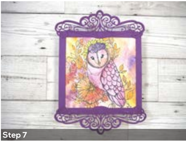
Glue the delicate trims to the top and bottom and display or hang.