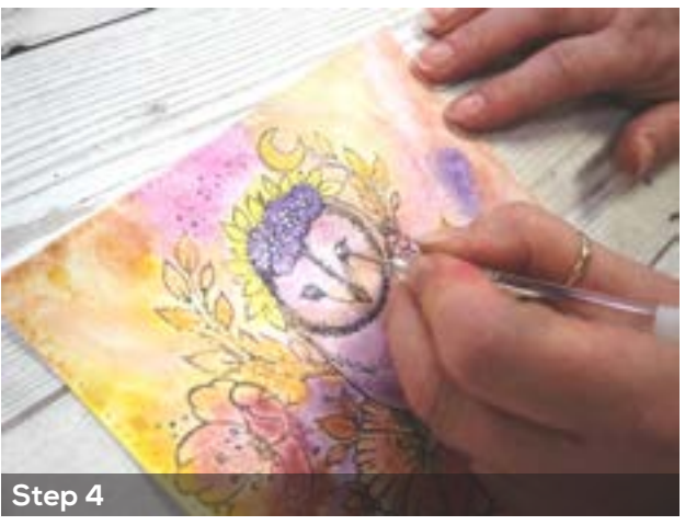
Once dry, enhance elements with white paint using the ball tool or cocktail stick and add detail to the black features with the fine black pen.