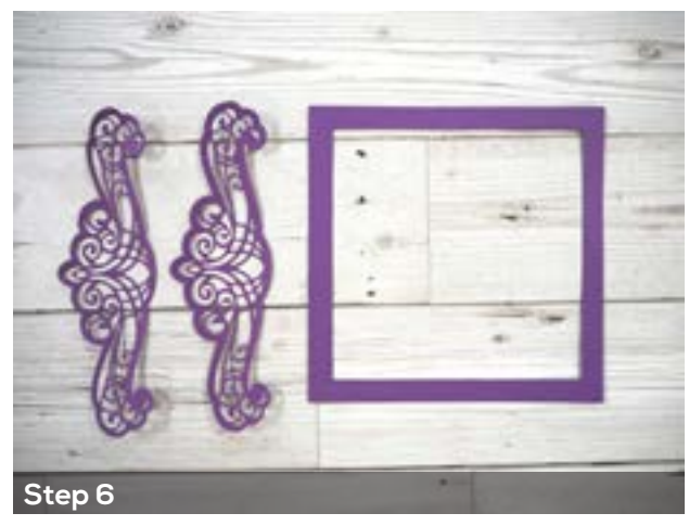
From Amethyst card, cut out the following: 1\,x Each of the square dies, 14.5 cm & 17 cm placed inside each other equally to create a frame. 2\,x Gemini dies full set. Glue onto the canvas front.