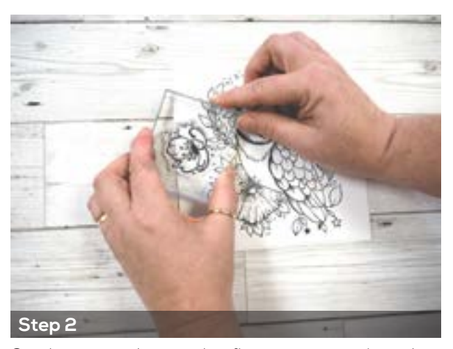
Cut the watercolour card to fit canvas approximately 15cm x 15cm. Stamp the Owl image using the Squid Ink Cave Black on the watercolour card. Lightly spritz the watercolour card with water.