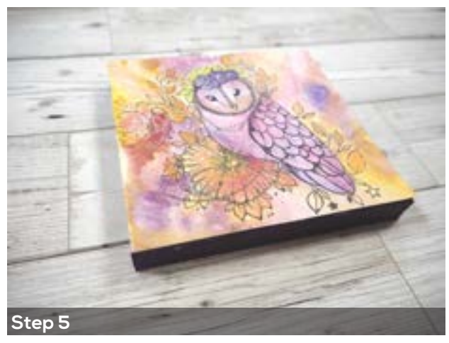
Attach the owl image to the canvas.