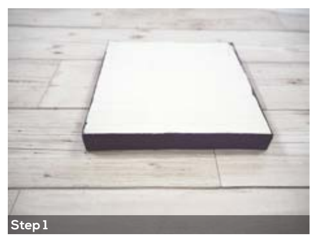
Paint canvas edges in Pink Ink Multi Surface Paint Aubergine and set aside to dry.